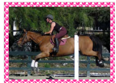
Bottom right : Brezzy jumping 3.6 with total ease..