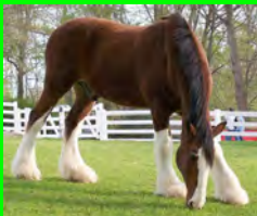
Horse of the month Clydesdale.